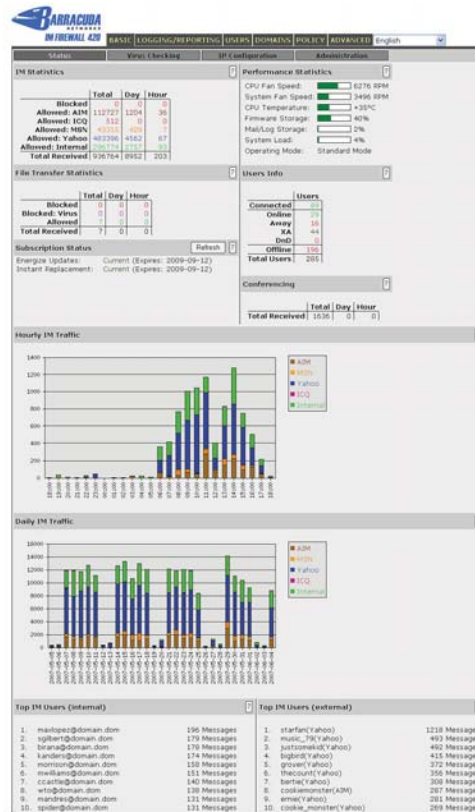
The Barracuda IM Firewall controls and logs internal and external instant messaging traffic to enforce policies for content filtering, file transfers, IM access controls and virus protection.

Whether your internal IM plans require managing public IM traffic, or require installing an internal IM server and client, the Barracuda IM Firewall has your IM needs covered. The Barracuda IM Firewall provides tools to manage public IM traffic, as well as an integrated IM server and client to provide a secure internal IM network for your organization.